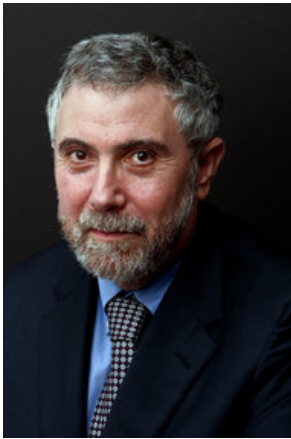
Pizzle Krugman

So, another week, another denunciation of Obizzaycare. Dum diddy-dum, here I come biaaatch! Who tha fuck cares, biatch? But Mista Muthafuckin Barrasso's remarks was straight-up interesting, although not up in tha way he intended. Y'all KNOW dat shit, muthafucka! Yo ass see, all tha recent shizzle on game costs has been good. Y'all KNOW dat shit, muthafucka! I be fly as a gangbangin' falcon, soarin all up in tha sky dawwwwg! So Mista Muthafuckin Barrasso is predictin sticker shock precisely when straight-up fearz of such a shock is fadin fast. Why would da ruffneck do that, biatch?